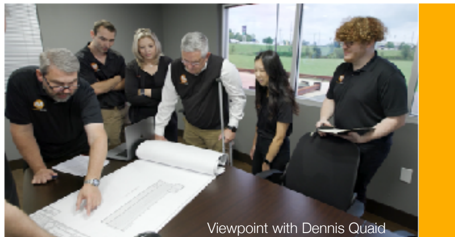
Viewpoint with Dennis Quaid